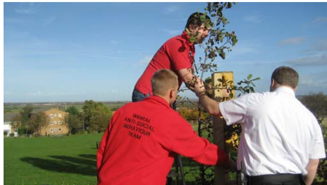
Grange Park, West Kirby

The Grange Park area of West Kirby saw environmental improvements led by the Friends of Grange Park residents' group with the planting of cherry trees and a lantern making workshop with children and young people. Tower Grounds in New Brighton saw local residents lead on an environmental audit with agencies. Work was undertaken in partnership with Leasowe Community Homes, taking the opportunity to speak with residents and young people attending the annual 'Unity in our Community' Halloween fancy dress party.